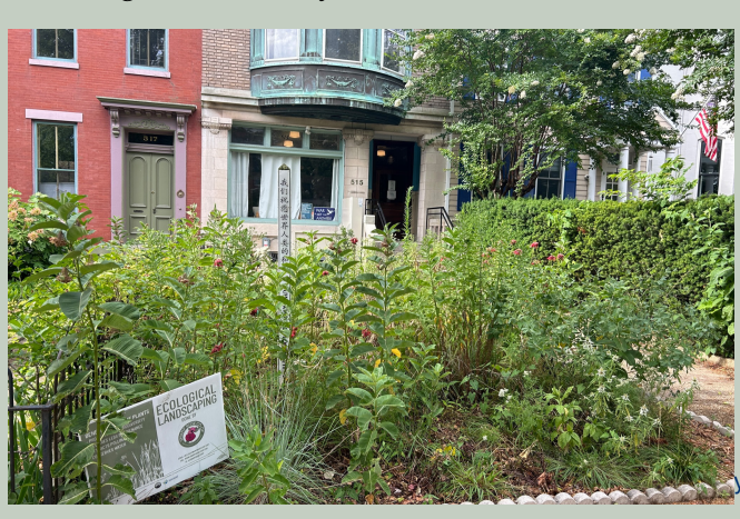
Green wall progress in the courtyard (L) and front garden of native plants (R).