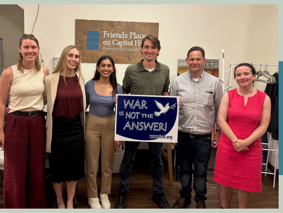
Staff and attendees as May's film screening