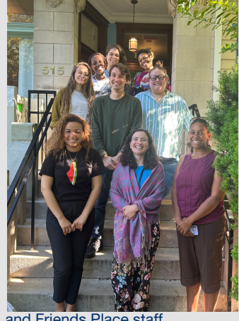
Continuing Revolution participants, guest speakers, and Friends Place staff